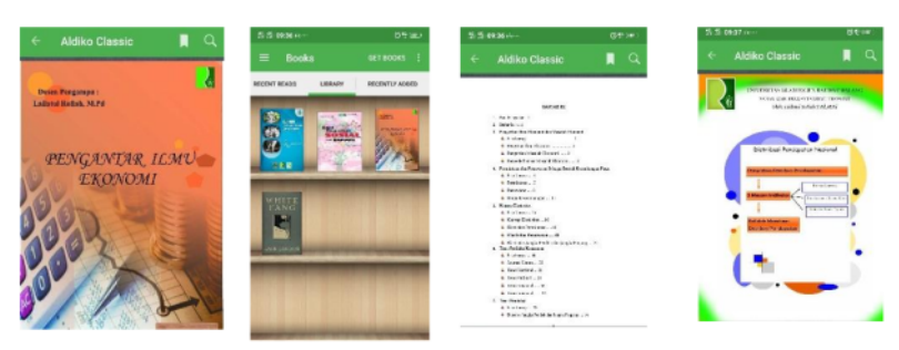
Figure 3.1 Learning Material on Aldiko Classic Application

The learning materials developed can be observed in Figure 3.1, in which it has been conducted validity test by the validator, experts in media, and learning materials. The average result of the learning material's validity or feasibility score which has been developed is 83%; as a result, the writers conclude that the e-book-based learning material of introduction to economics by applying Aldiko Classic application was feasible