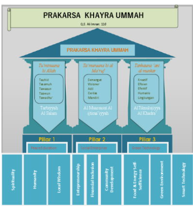
Figure 4. Comprehensive Khayra Ummah initiative model

Figure 4 illustrates the three pillars of the Khayra Ummah , namely (1) Peace Education, (2) Social Enterprise, and (3) Green Technology. The Peace Education pillar is a translation of the theme of al-ma'ruf (humanization), which is then driven by the creation of the values of spirituality, humanity, and local wisdom. The Social Enterprise pillar is a translation of the theme of nahi munkar (liberation), which is then driven by the creation of the values of entrepreneurship, financial inclusion, and community development. The Green Technology pillar is a translation of the theme of iman billah (transcendence), which is then driven by the creation of the values of food and energy self-sufficiency, green environment, and smart technology.