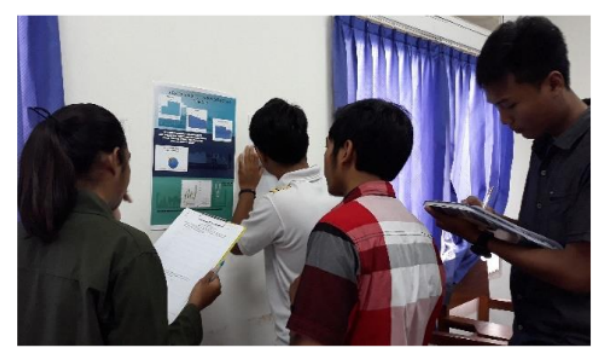
Figure 3. The participants record the answer and the question on the worksheet

While students got around the exhibition, they have to write down all the questions and answers they have done (see Figure 3). Since this study will examine student's reflective thinking skills based on their answer in the worksheet.