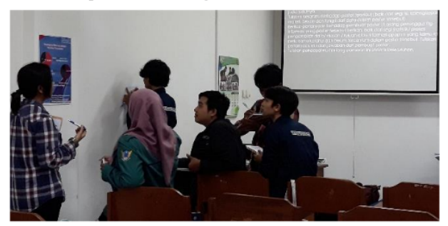
Figure 4. The visitors observe the poster maker explanation seriously

The design of the poster also become one of attractive point in the exhibition. The visitors usually come into their favorite poster first then asking some questions. In this phase, visitors tried to pay full attention into poster makers' explanation (see Figure 4).