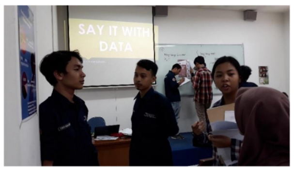
Figure 2. The poster maker answers visitor questions

enthusiastic in playing their roles. The visitors truly bombarded the poster maker with many questions in the middle of hot class air as seen in the Figure 2. The poster maker should be able to explain all about the poster of their group made, the content, the process, the analysis or the conclusion.