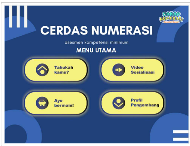
Fig. 2. The Display of “CAKAP NUMERASI” Game Main Menu

This media also displays the Main Menu (Figure 2), which consists of initial information related to numeracy which can be accessed on the Did You Know menu. Furthermore, the Socialization Video contains videos related to the introduction of numeracy as available on the Ministry of Education and Culture's AKM page. Numerical assessment is available on the Let's Play menu, and the name of this media developer is written on the Developer Profile menu.