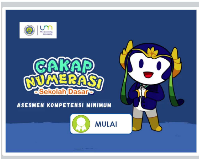
Fig. 1. The Initial Page of “CAKAP NUMERASI” Game