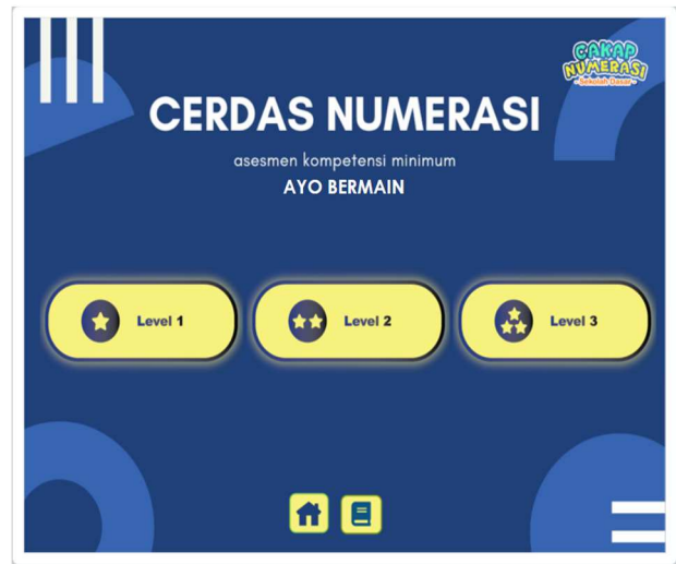
Fig. 3. The Level of “CAKAP NUMERASI” Game

This media also displays the Main Menu (Figure 2), which consists of initial information related to numeracy which can be accessed on the Did You Know menu. Furthermore, the Socialization Video contains videos related to the introduction of numeracy as available on the Ministry of Education and Culture's AKM page. Numerical assessment is available on the Let's Play menu, and the name of this media developer is written on the Developer Profile menu.